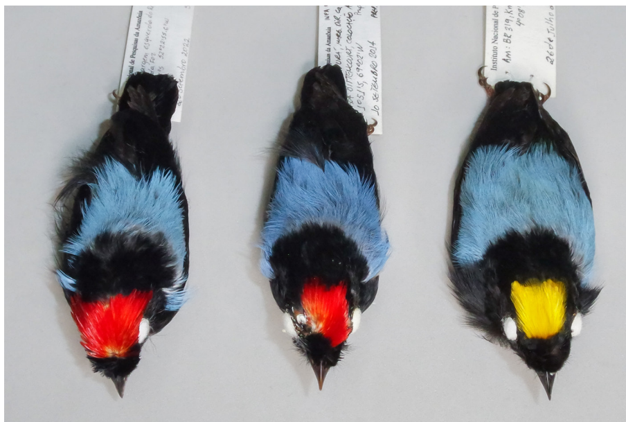
Figure 1. Dorsal view of adult male specimens of Amazonian Chiroxiphia species (from left to right): C. pareola (INPA 7106), C. napensis (INPA 6572), and C. regina (INPA 4263). Note the slightly darker blue back of C. napensis , compared to C. pareola , considered a diagnostic feature (Miller 1908).

To update the previously proposed distributions by including more recent information, we plotted records identified to subspecies from the Global Biodiversity